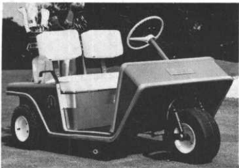
E-Z-GO GOLF CAR THREE WHEEL MODEL GAS OR ELECTRIC