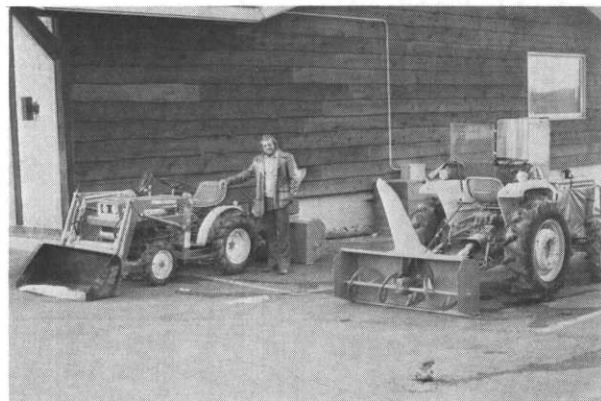
DISPLAY. Don Lindblad looks over Long Lake Ford products in Hanson House parking lot.