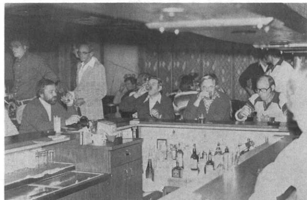
COMMITTEE MEETING. Some great decisions being contemplated. Recognize anyone?