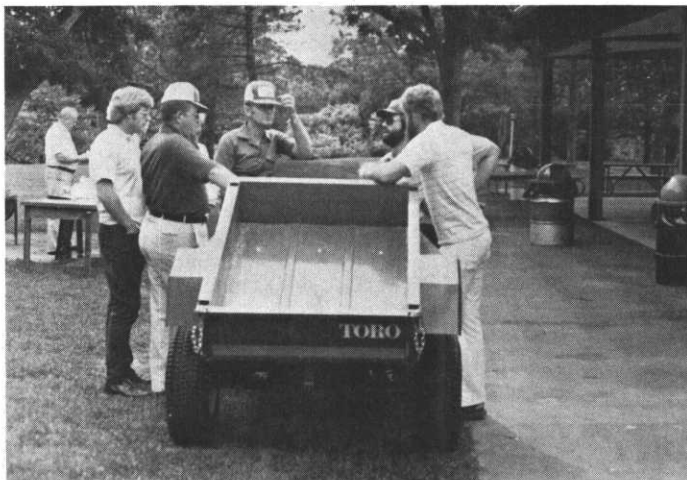
TRUCK TALK. Display prompted conversation and stories. Some true and some - well!