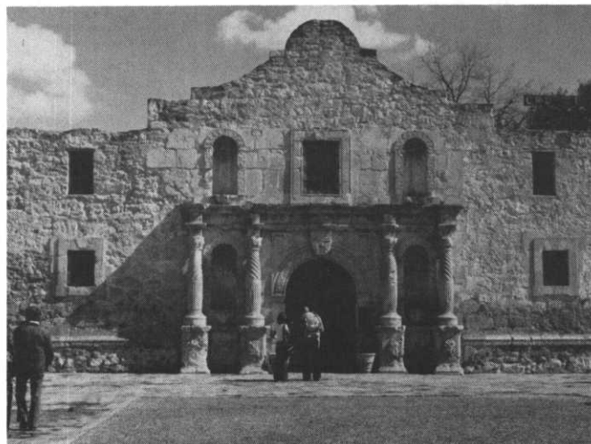
The Alamo on a bright sunny day fascinates visiting superintendents.