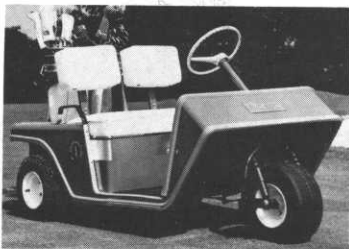
THE E-Z-GO MAINTENANCE MACHINE GT-7 TRUCK