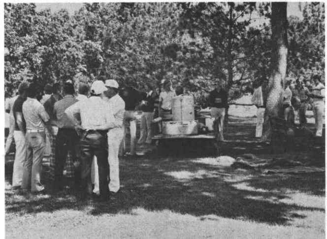
ONLOOKERS. Part of the interested crowd that attended the demonstration at the Austin Country Club.