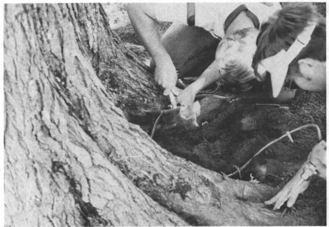
WORKERS. Drilling holes and inserting tubes in roots excavated at base of elm.