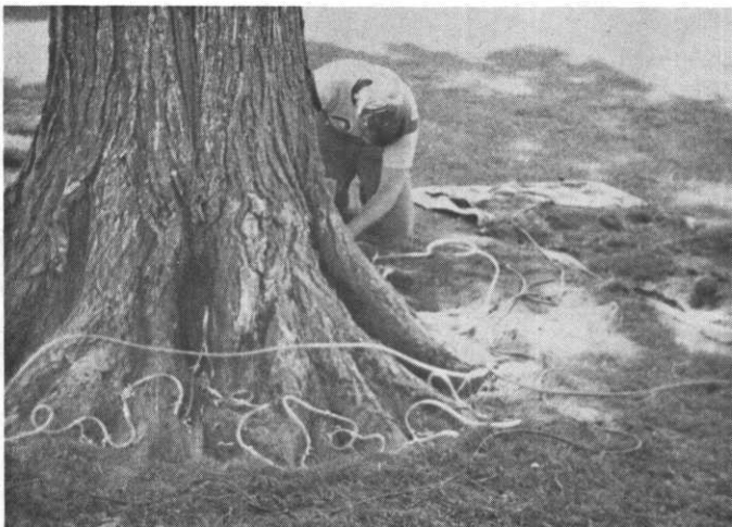
TANGLE. Typical network of tubes leading to each tapped root on elm.