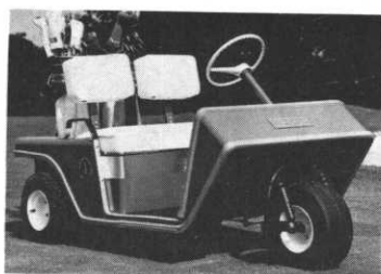
THE E-Z-GO MAINTENANCE MACHINE GT-7 TRUCK