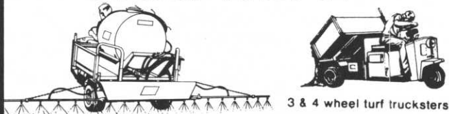
3 & 4 wheel turf trucksters