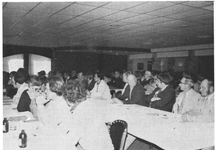
A knowledge hungry crowd jammed the Hillcrest Country Club meeting room.