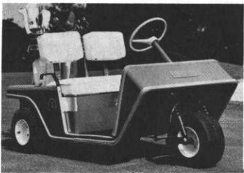
THE E-Z-GO MAINTENANCE MACHINE GT-7 TRUCK

E-Z-GO GOLF CAR THREE WHEEL MODEL GAS OR ELECTRIC