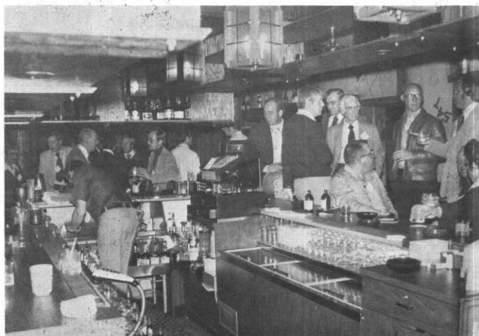
HAPPY HOUR. Bartender's view of cocktail hour action when everyone suddenly becomes an expert.