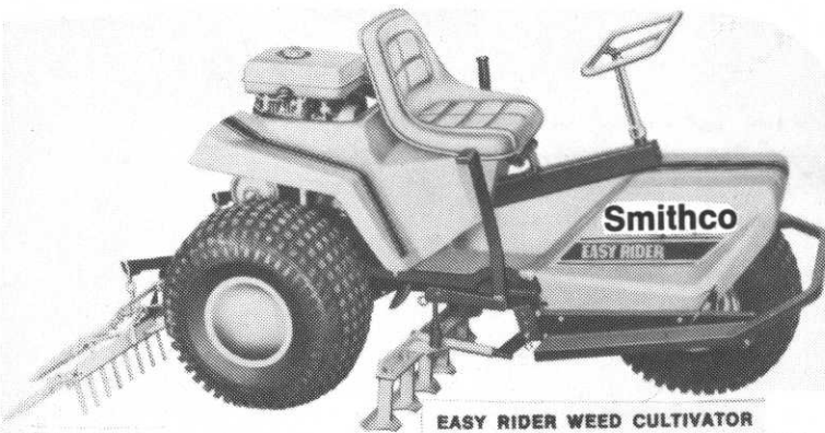
EASY RIDER WEED CULTIVATOR