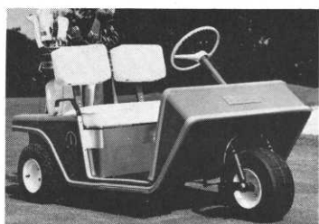
THE E-Z-GO MAINTENANCE MACHINE GT-7 TRUCK