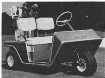
THE E-Z-GO MAINTENANCE MACHINE GT-7 TRUCK