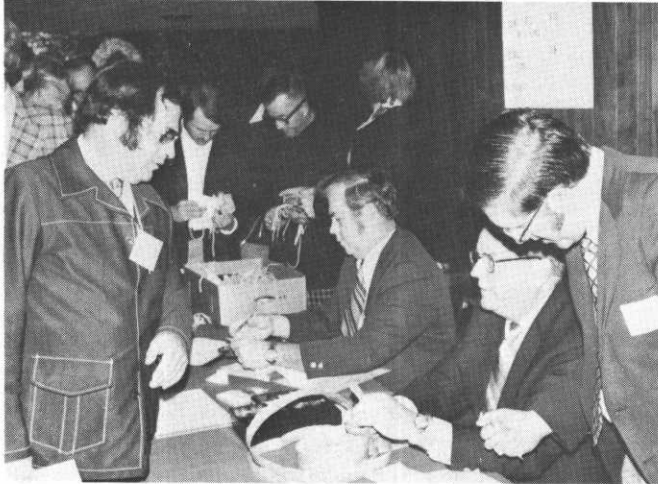
ACTIVE REGISTRATION DESK. Typical of the day's activity was this crowd at the entrance to the conference room.

A standing room only crowd of extremely interested Minnesota Golf Course Superintendents attended the 48th Annual Turf Conference and Business Meeting at the Normandy Motor Inn on December 4, 1975. Six informative speakers, each an expert in his field, covered subjects from hardy grasses to soil mixtures for golf greens at the morning session. The afternoon session was highlighted with a preview of the 1976 International Conference to be held in Minneapolis and a "bull session" where all members were allowed to speak their minds on various subjects.