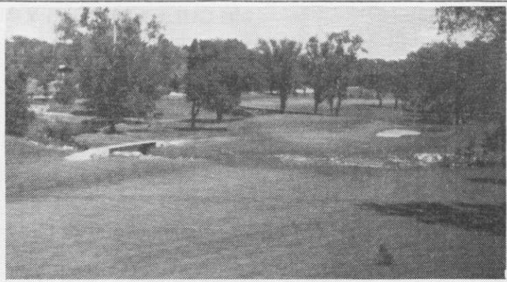
Editors Note: Pictures in this issue taken at various times and places.