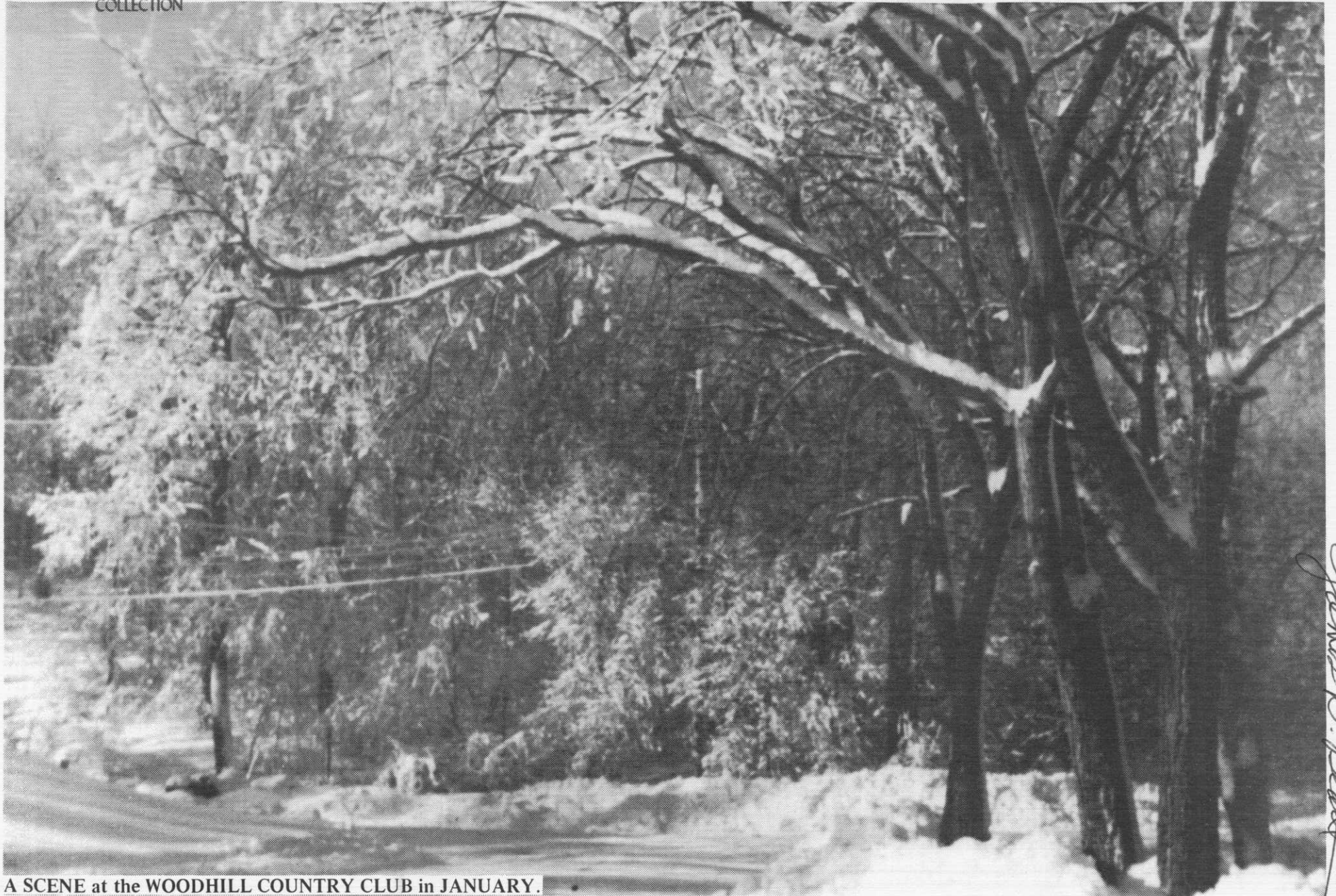
A SCENE at the WOODHILL COUNTRY CLUB in JANUARY.