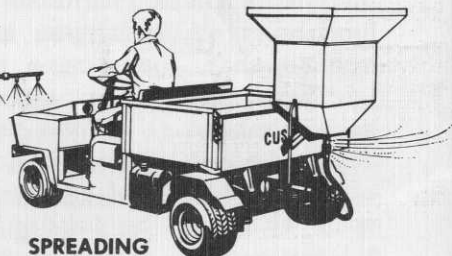
SPREADING Spread up to 40' swath.