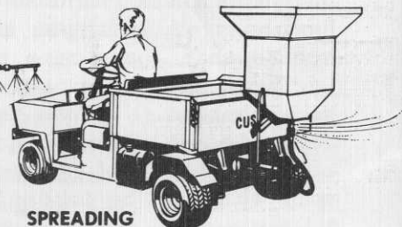
SPREADING Spread up to 40' swath.