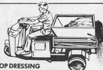
TOP DRESSING Mounts on Truckster chassis. No need for separate engine.

Purchase one of the basic Cushman Turf-Truckster vehicles available in 3 or 4 wheel models with 12 or 18 hp. Then add as many of the new modular accessories as you need for the work you have to be done. No need to buy another expensive vehicle. In minutes you can attach the module you need by using simple pins that slide in and out. No need for tools.