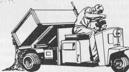
DUMPING/HAULING 1000 lb. payloads. Manual and hydraulic dumping.