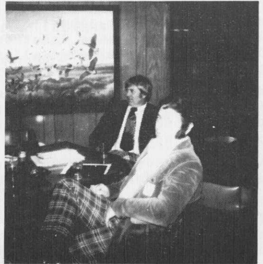
AT THE APRIL MEETING