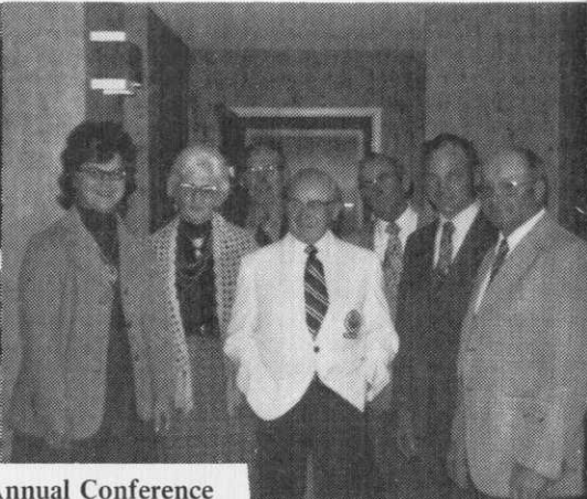
Pictures on this page taken at Anaheim during GCSAA Annual Conference