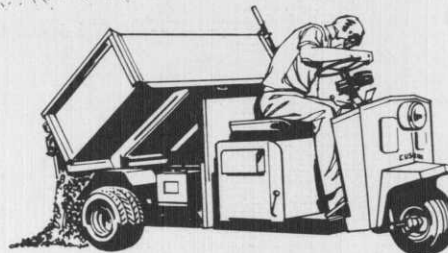
DUMPING/HAULING 1000 lb. payloads. Manual and hydraulic dumping.