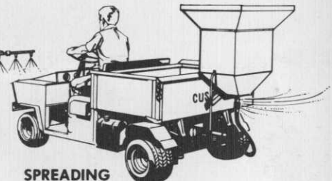
SPREADING Spread up to 40' swath.