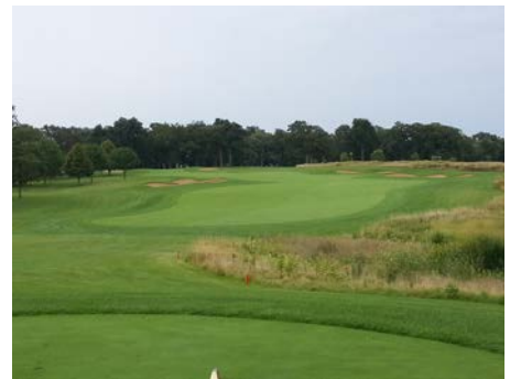
The par 4 9th hole at the Merit Club plays 412 yards

* Greensmower mounted brushes to increase putting quality without negative health effects.