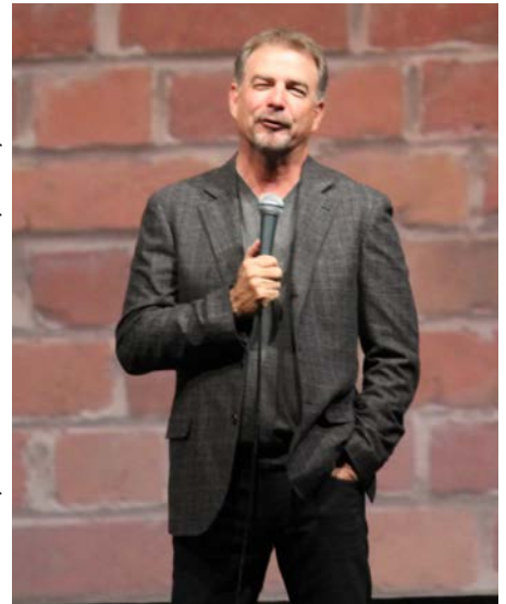
Comedian Bill Engvall had the audience in tears at the closing session.

Next year the show heads to San Antonio. If you have never been to the conference I would highly recommend it as a great educational and networking opportunity. Now I just need to find my boots and polish my spurs! 🌱