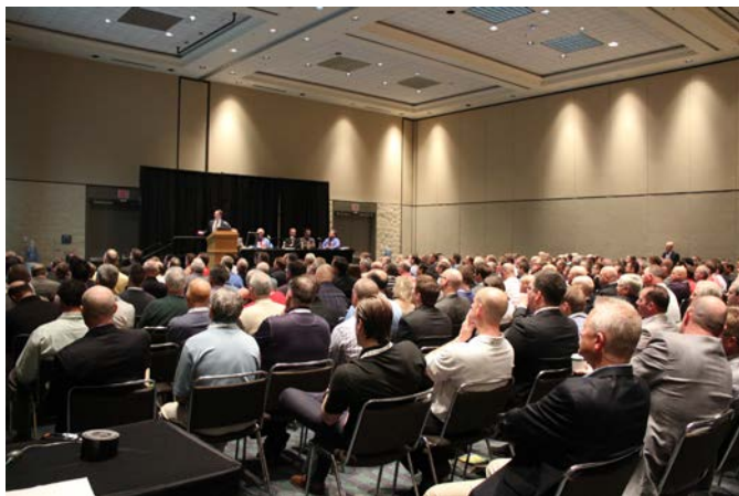
A packed room at the innovative superintendent session on Tuesday morning.

With 20% of clubs managed by multi-course operators it can be a system to save some clubs. The best take home point was pools are a horrible investment for northern clubs.