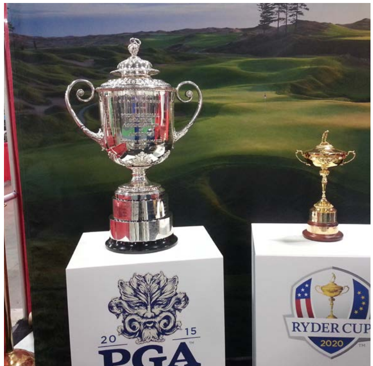
Visitors to the Milwaukee Golf Show had a chance to see the PGA Championship Wanamaker Trophy and the Ryder Cup.