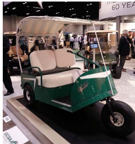
The 1954 E-Z Go golf cart helped modernize the game.