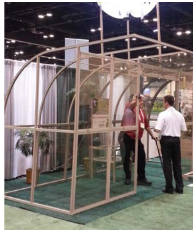
This bus stop looking shelter is a good easy to build golf course shelter.