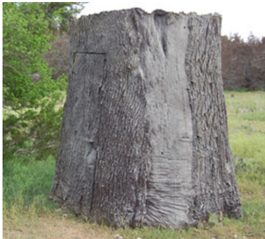
This Nature Calls Port-a-potty blends in and is large enough to be handicap accessible.