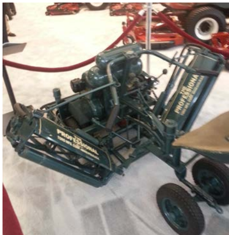
The 1940 Toro 76" Professional Mower was on hand to showcase Toro's 100 year anniversary.