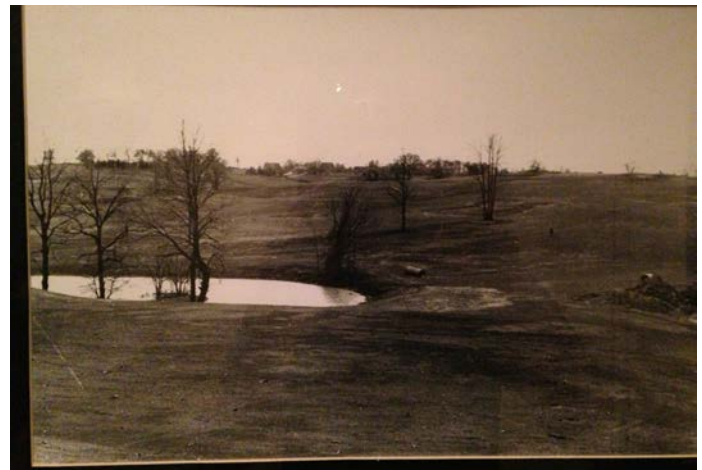
ABOVE: Holes 1 and 18 in 1967 during construction

In 1985 Jack Nicklaus competed in the GMO for the first time as a professional and finished second to Jim Thorpe. It was one of Jacks 58 second place finishes.