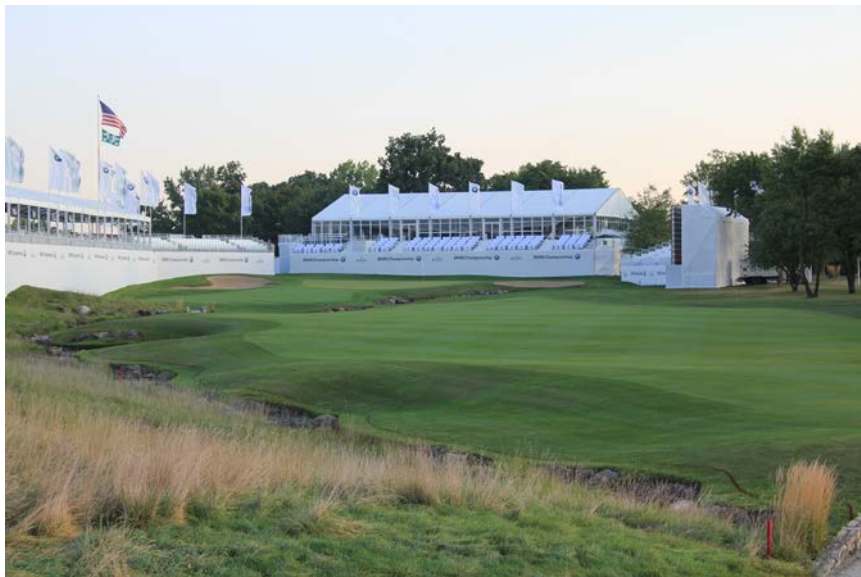
Top Right: The 18th Hole, Par 5, 570 Yards

The goal was to provide a layout that is challenging for the tour players but playable for the members who belong to the course. Conway Farms has a unique membership with 169 of 255 regular members carrying a single digit handicap.