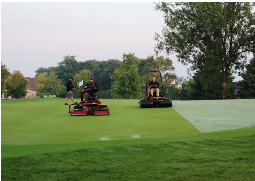
Mowing and rolling the 366 yard par four 4th hole.