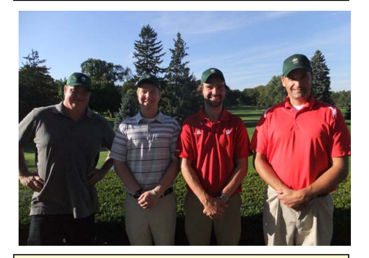
Thanks for the wonderful golf course conditions team Maple Bluff.