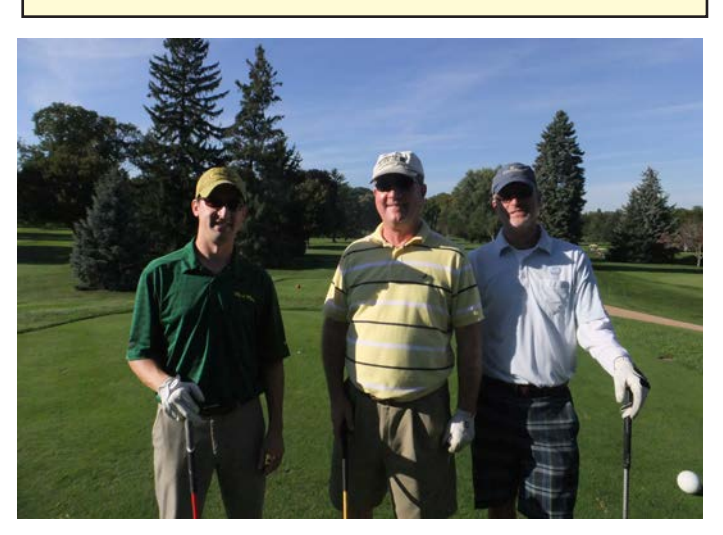
Representing Lawn Care, team Kurth can play some mean golf.