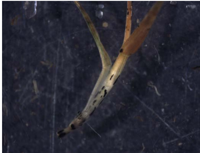
Above: Figure 1. Anthracnose, both basal rot and foliar, was widespread amongst golf course turfgrass throughout Wisconsin and the Midwest in 2012.

The drought of 2012 will go down as one of the most severe on record, rivaling the legendary droughts of 1995 and 1988. Nearly two dozen counties in Wisconsin were designated federal disaster areas. For most in southern Wisconsin, it stopped raining in mid to late May and didn’t start up again until late July. Moisture is the driving environmental factor for most plant diseases, and the dry conditions limited the development of many turfgrass diseases such as brown patch and Pythium blight in 2012. But areas of poor irrigation coverage and high-stress areas on the collars and clean-up passes suffered badly in the prolonged drought. As a result, diagnoses of abiotic turf damage and stress-related anthracnose (Figure 1) jumped sharply in 2012 (Table 1).