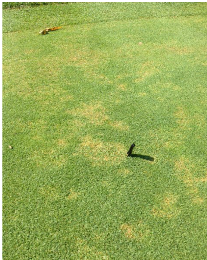
Right: Figure 2. Along with anthracnose, summer patch was the premier disease of annual bluegrass in 2012.