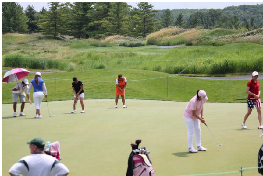
The putting green is a popular place for players and fans.

Blackwolf Run was opened in 1988 as a 18 hole course and success soon necessitated opening a 2nd 18 hole loop. The new holes were placed outside the original holes leading to the Rivers Course and Meadows Valley Course. The Open was played on the original Championship Course or a combination of the current 18's.