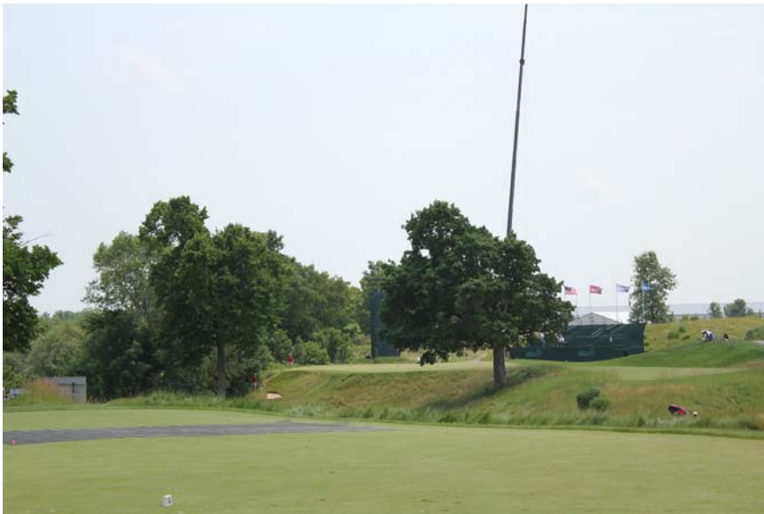
Top Left: Morgan Pressel Hits out of the sand on hole 15.