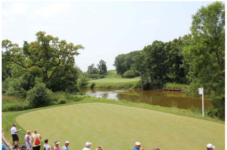
Above: Hole 1 From The Tee Middle: Hole One from Approach Bottom: Hole One from behind green looking back.