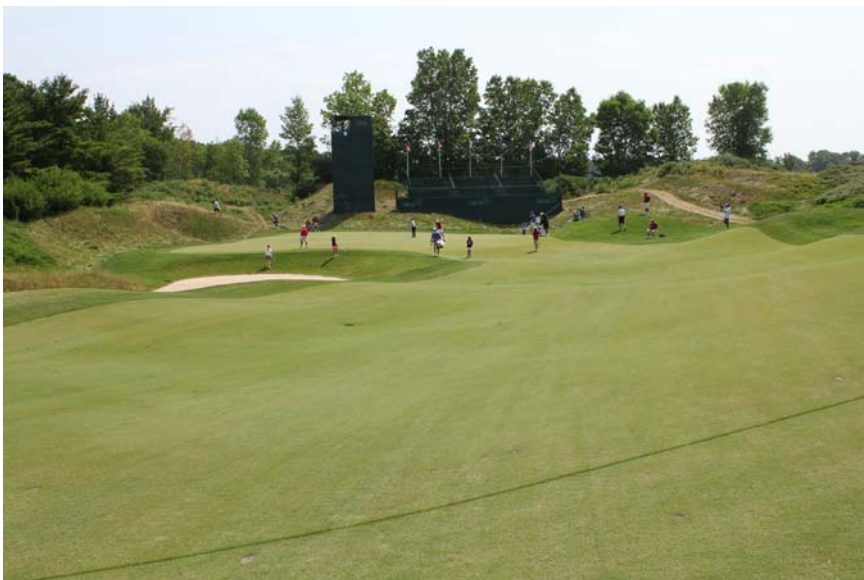
Bottom Right: Hole 12