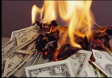
What the owner thinks I do