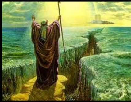
What the Members want me to do