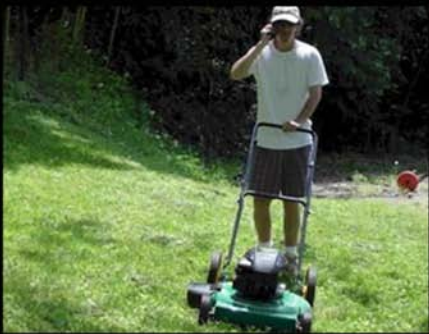
What the Golf Pro thinks I do