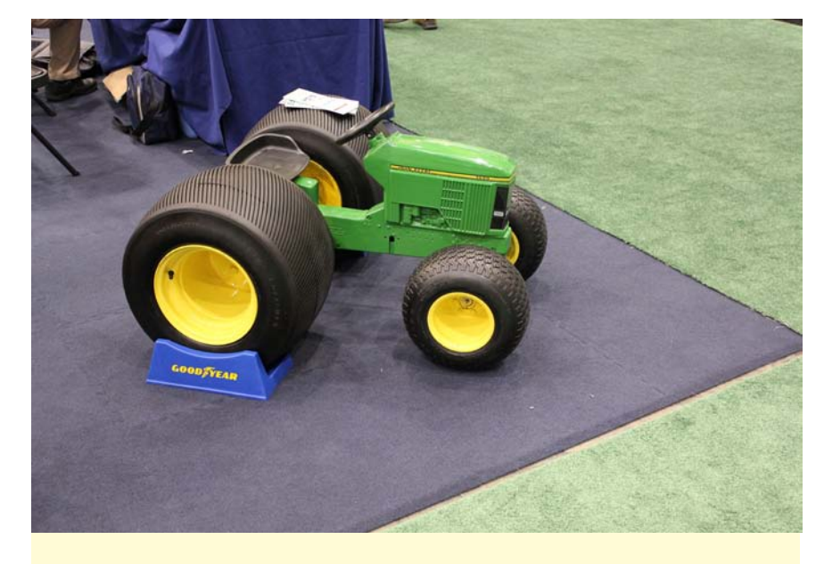
McCord Tires provide new slicks for every size tractor. Pomps tires in Wisconsin is a new dealer for McCord.

Next year the show moves to San Diego and provides a great opportunity to mix business with pleasure.