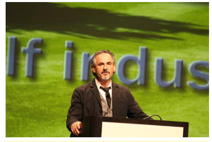
David Feherty rocked a packed house at the General Session and was worth the price of the show by himself.