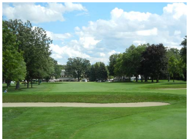
Erin Hills (Left) Par 4 - 11th Hole plays 458 yards with challenging tee shot over natural fescue. Blue Mounds (Right) Par 5 - 18th Hole plays 558 yards with cross bunkers in the fairway landing area.