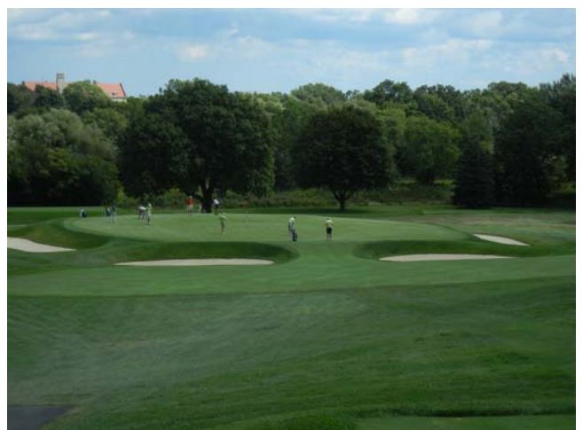
(Left) Without carts Erin Hills offers narrow packed walking paths to prevent hillside erosion. (Right) Blue Mounds Par 3 - 7th Hole offers 167 yards to a green surrounded by deep bunkers.