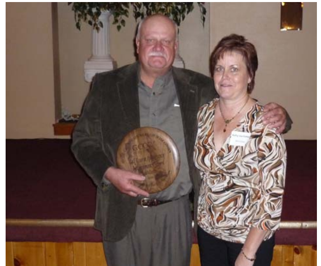
WGCSA Members recently won awards from the Golf Course Owners of Wisconsin