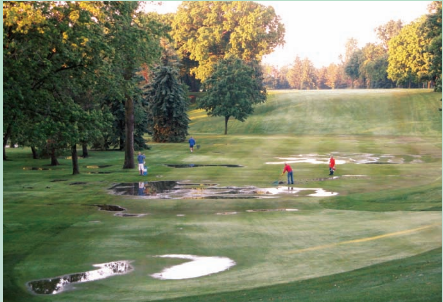
The staff at Butte des Morts cleans up after one of the many floods this summer.

In 1998, 23,130 people were injured in this country while shooting for that challenging and rare chance at the perfect game. That's right, bowling! Not boxing, hockey or even cheerleading can complete with the injuries seen in