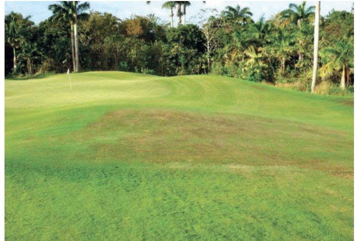
Area of fairway at Apes Hill GC, Barbados treated with a mixture of processed chicken manure and green dye to lessen impact of drought stress