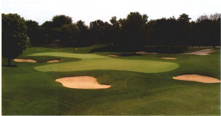
Hole 8 at Oconomowoc Golf Club

The club is on the 2nd highest elevation in Waukesha County and has about 10" of topsoil overlaying gravel. This soil profile makes drainage one thing Dustin and his staff do not have to worry about. The only rain concern they do have is the fact Oconomowoc Golf Club is one of the few remaining clubs with member carts. A restriction of cart traffic during wet periods becomes