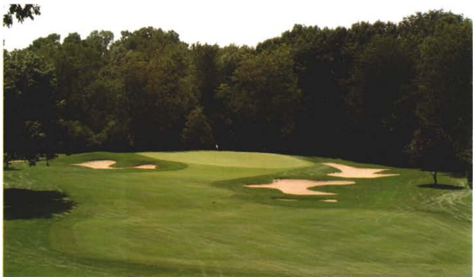
Hole 12 at Oconomowoc Golf Club

more challenging politically when the members own the carts. Dustin has rebuilt two greens to USGA specifications while the other 16 native soil greens offer some challenges with past inconsistent modified green expansions.