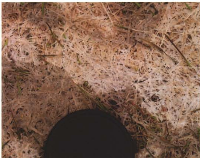
Figure 1: The sclerotia of gray snow mold ( Typhula incarnata ) are comparatively large and red in color, while those of speckled snow mold ( T. ishikariensis ) are smaller and black.

nata ), speckled snow mold ( T. ishikariensis ) and Microdochium patch ( Microdochium nivale ). Microdochium patch can oftentimes be differentiated from the Typhula diseases by the presence of a reddish ring around the outside of the patch or the lack of sclerotia embedded in symptomatic turfgrass leaves (Smiley et al. , 2005). Sclerotia are small, hardened masses of mycelium that act as resting bodies for the fungus. Sclerotia of T. incarnata are comparatively large and red, while those of T. ishikariensis are smaller and black in color (Figure 1). Snow mold symp-