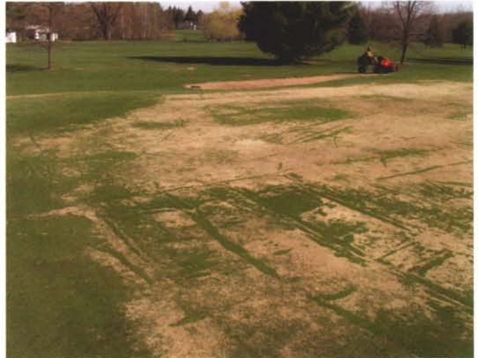
Figure 2: Ice damage oftentimes takes on a more irregular pattern than snow molds.

Since nearly every golf course in Wisconsin applies fungicides for the control of snow mold on at least their putting greens and tees, the main questions will be which fungicides are most effective at controlling snow mold under these conditions and how quickly the turf can recover where fungicides were either not applied (i.e. roughs and possibly fairways) or not effective. For how effective different fungicide combinations may be under heavy snow mold pressures you can view the 2005-2006 Snow Mold Trial at Gateway Golf Club in Land O' Lakes, WI included in the 2006 Wisconsin Turfgrass Research Reports on the Wisconsin Turfgrass Association website ( www.wisconsin-turfgrass-association.org ). Snow mold pressure was extremely high during the trial at this location, and differentiated those treatments effective at high pressures and those that broke down. In general, those treatments that included three different active ingredients were the most effective at controlling snow mold under heavy pressures. With the unusually high disease pressures this winter in southern Wisconsin it is possible that golf courses throughout the state that applied only one or two active ingredi-