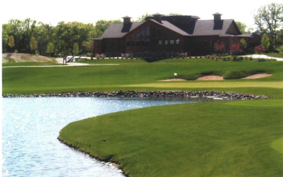
The 18th hole at Northern Bay is a replica of the 18th hole at Bay Hill.

Put this annual event on your list of things to do next season. It is a great way to see another superintendent's hard work while seeing how good your golf professional really is when you put your par 4 drive in the woods 300 yards from the green and they have to hit it on the green to save par for the team. 🌱