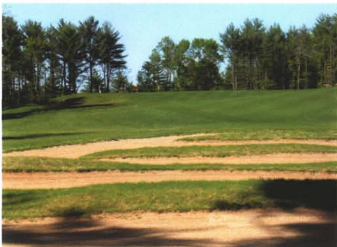
The 12th at Northern Bay features the Oakmot "church pew" bunkering.