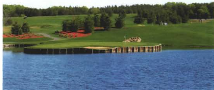
The 10th hole at Northern Bay is a replica of TPC Sawgrass Island Green.