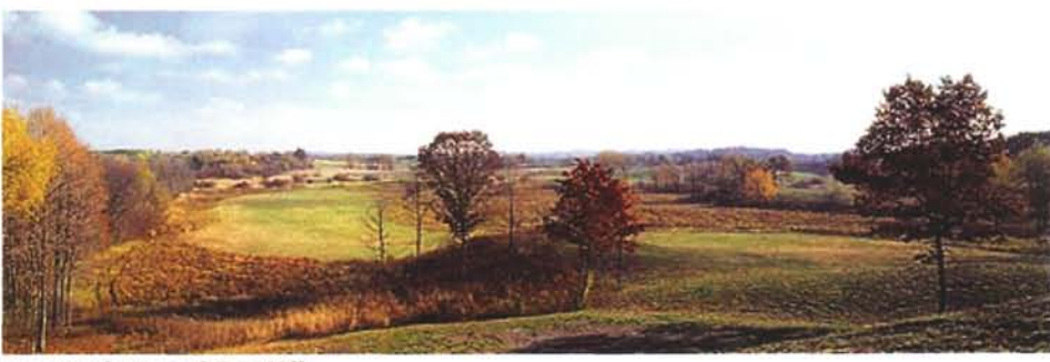
A natural view of Erin Hills.

Coming on board early in the construction allowed Jeff the opportunity to see the property in its original condition. One of his goals at Erin Hills is respecting the natural feel of the property and staying in tune with nature while maintain the fine fescue with as little input of products as possible.