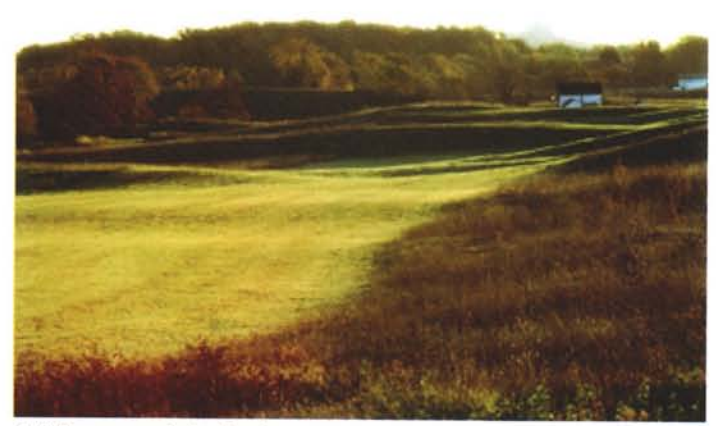
A fairway made in the ice age.