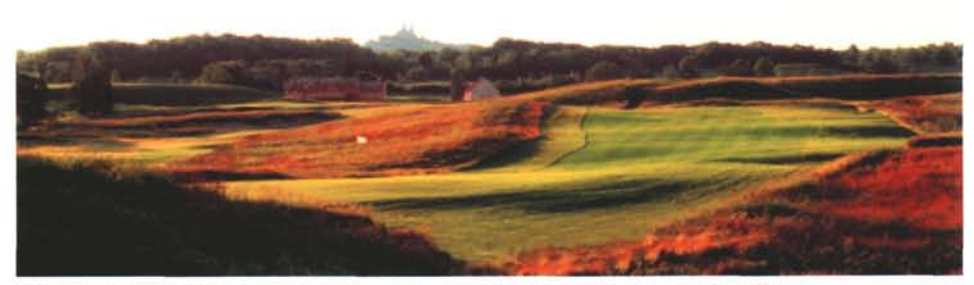
The finished fairway looks just like the pre-construction picture with a flag