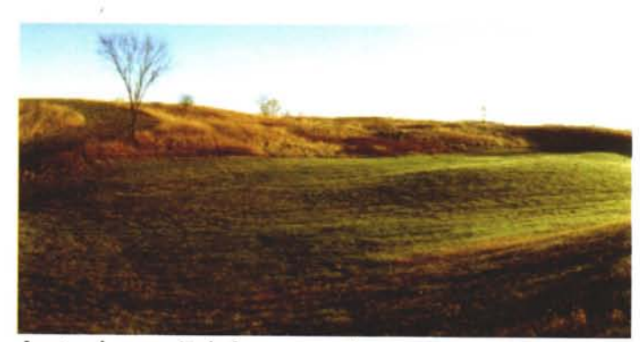
A natural green site before construction.

Overseeing this unique property is Golf Course