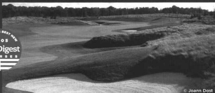
Best New Private Courses—Canyata, Marshall, Illinois

When Golf Digest announced its best new courses of 2005, Lohmann Golf Designs walked away with two awards. Unique and challenging holes are our trademark; environmental stewardship and timeless design are our benchmarks.