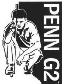
Putting Green Quality Creeping Bentgrass

The list of what makes PENN G-2 so different and so good goes on and on. Moderate fertility, heat tolerance and disease resistance and reduced Poa annua invasion are just a few of the highlights. What it all comes down to is simple. Whether you are building, renovating or interseeding, PENN G-2 is your grass. Why? Because it's as good as it is different.