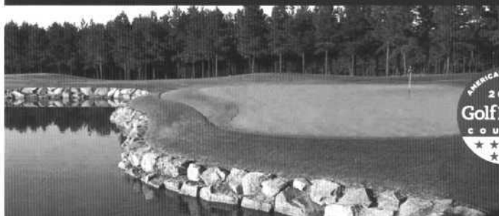
Best New Upscale Public Courses—Mattaponi Springs, Ruther Glen, Virginia