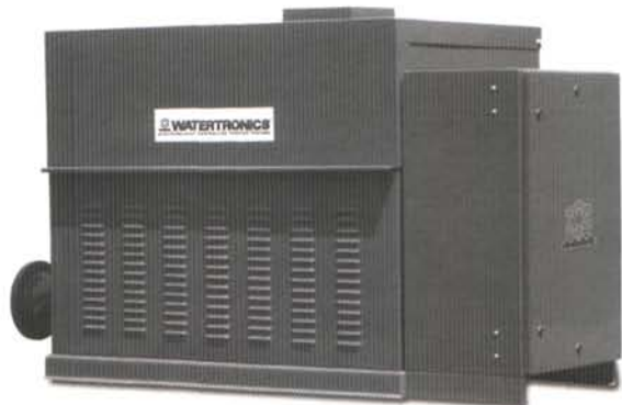
Super Sport - Turf

The “Evolution Series” pumping system is a proven concept from Watertronics that utilizes a VFD driven jockey/pressure maintenance pump and Electronic Butterfly Valve controlled main pump(s). This control system allows for VFD control of the pump that most benefits from it. Conventional VFD stations share one drive between all main pumps which can cause “across-line” start/stop surges.