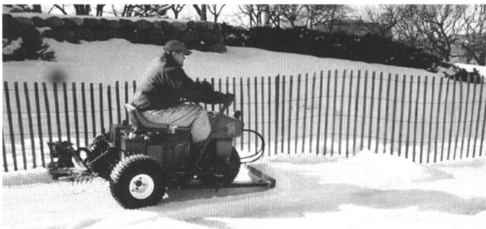
Dealing with ice in the late winter of this year generally involved clearing snow (many techniques were used to do that)...

There is no reason to diminish how miserable these circumstances can be' believe me, I know. Thirty-three years on a Wisconsin golf course have afforded me every opportunity to see it all, including 17 temporary greens on opening day in the mid-1970s. It isn't fun. But it is also amazing to see, from the distance of time, how quickly turf can heal. It doesn't seem that way day by day, but always by Memorial Day the warm days have worked their wonder. I feel confident that will be the case this year as well.