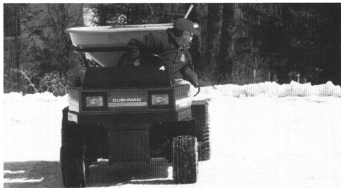
...and application of a dark material (topdressing in this case).