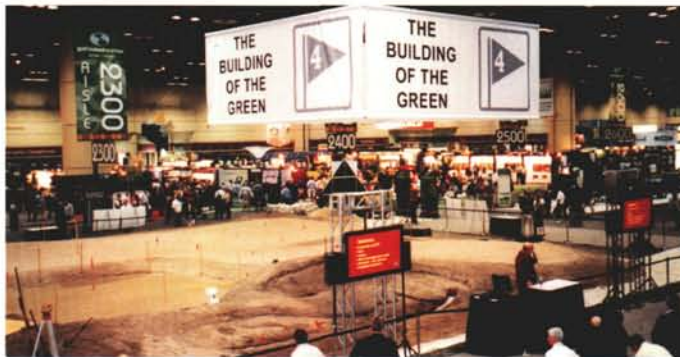
A bird's-eye view of the "Building of the Green" project.

I sat close to the stage and appreciated how he was willing to be involved in the superintendent awards portion of the program. And after a break, the Golf Channel stage set-up and filming was intriguing