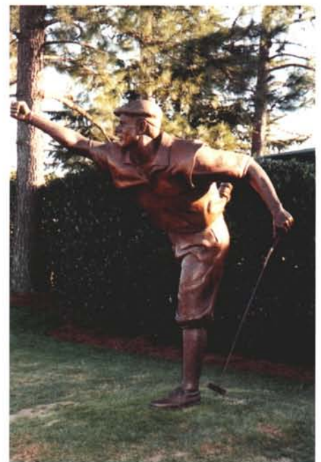
Payne Stewart grace the clubhouse lawn at Pinehurst.