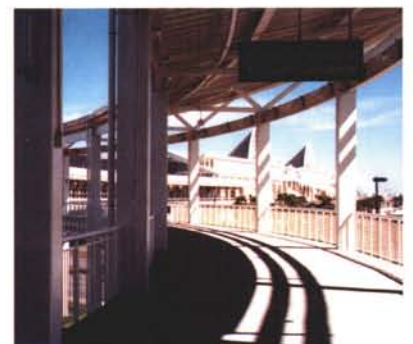
The new addition to the OCC is huge beyond words.