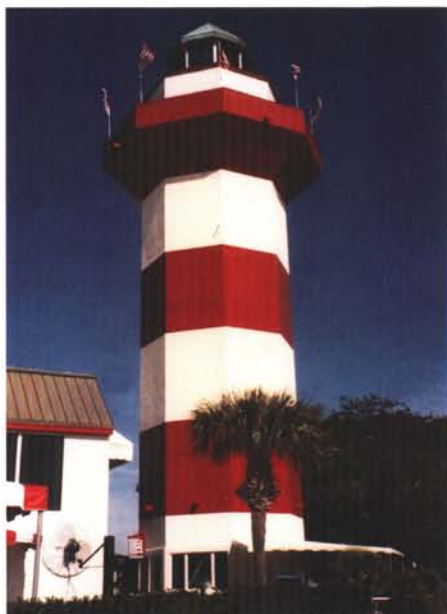
The lighthouse at Harbor Town overlooks the 18th hole, a golf course designed by Pete Dye and Jack Nicklaus.