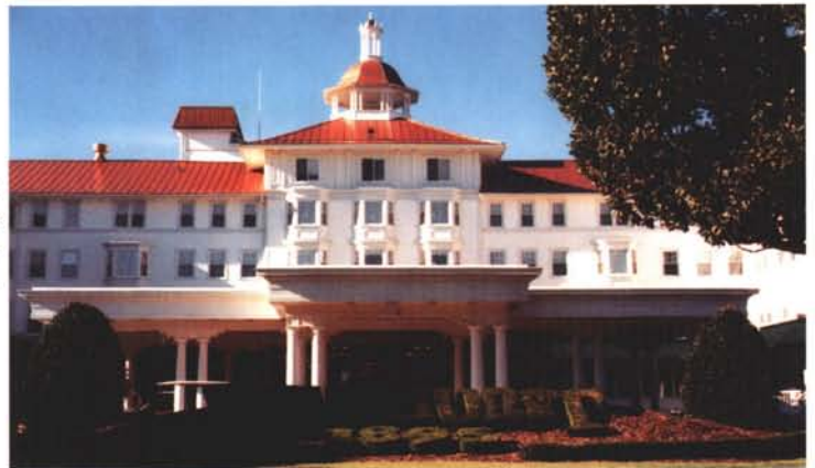
A visit to Pinehurst necessarily begins with a stop at the Carolina Hotel.