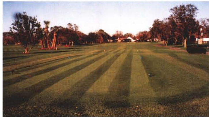
The 10th hole at Bayhill looks ready for the Bayhill Classic.