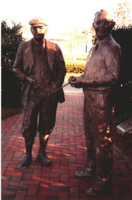
Statues of Donald Ross and Richard Tufts and...