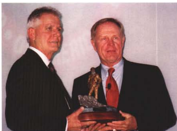
Jack Nicklaus was pleased to receive the 2005 GCSAA Old Tom Morris Award.