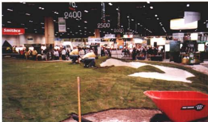
sodding and bunker filling to...