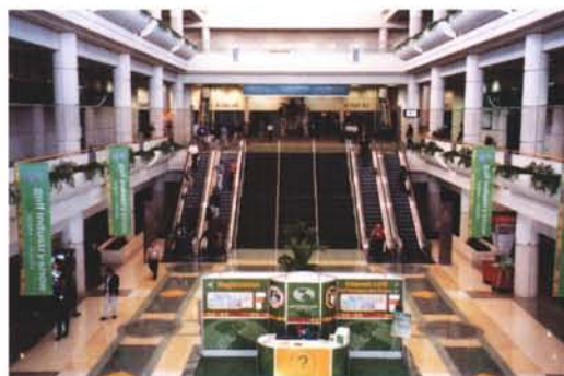
What a welcome - the Orange County Convention Center.