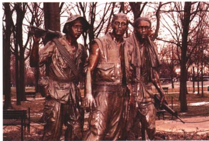
The bronze soldier statues of the Vietnam War Memorial were realistic, almost too much so for some visitors.

Merion, and it is remembered by most as the course with the red and white wicker basket on top of each flagstick.