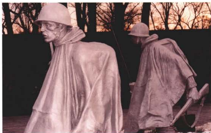
The sculpture of Korean War soldiers affects anyone seeing them.