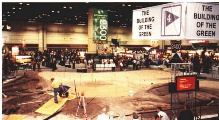
Building of the green, from start to...