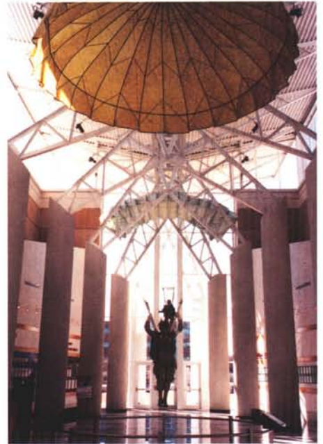
The welcome to the Paratrooper Museum includes a WWII paratrooper (foreground) and modern day paratrooper (background).

changed; the news at night has plenty of reports of violent crime, a subtle reminder to be careful of where you go. That's no different