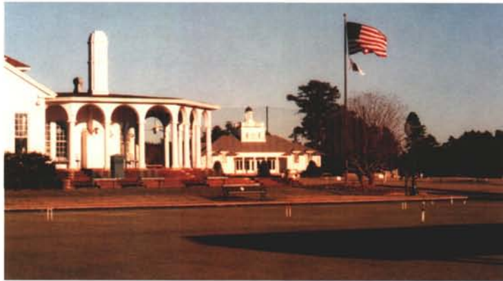
The late afternoon February sun created a beautiful setting at Pinehurst.