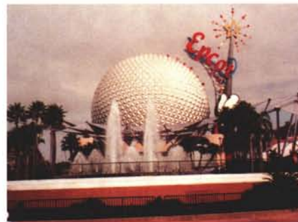
Many families took the opportunity to visit the Disney Resorts; Epcot is always a favorite.