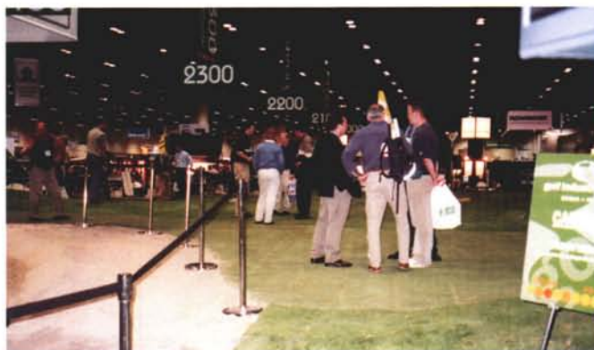
opening for play, all in three days.

pool supplies and the like - would clutter and trash OUR show. We were pleased to see those kinds of displays down on one end where you didn't have to go if you weren't interested. This still was a golf course superintendent's show.