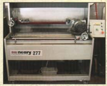
Neary grinders for sharpening reels and bed knives.