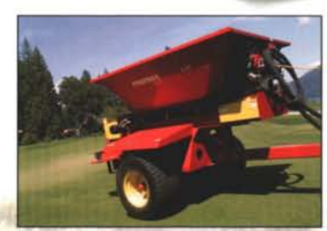
Ty-Crop top dressers for top dressing greens.

Reinders has quality equipment for every job on your course.