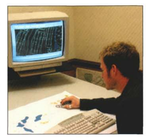
In-House CAD Design Reinders' CAD Department develops the optimal irrigation system for your course.