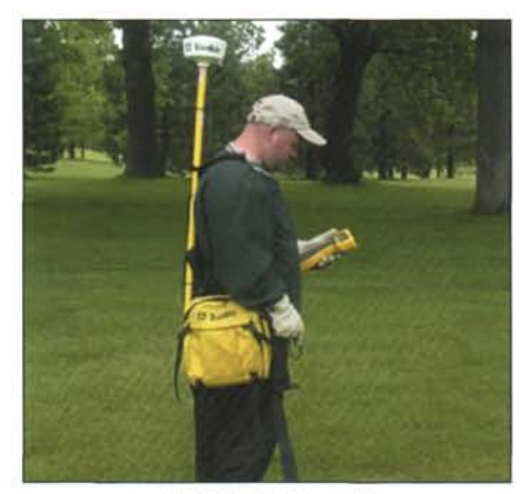
Reinders will map your course or you can rent our GPS unit.

A Reinders scaled drawing of your course provides measurements of area and distance of greens, tees, fairways, bunkers, ponds, etc.