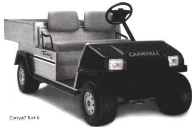
Carryall Turf II