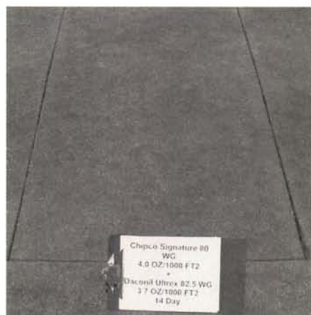
Signature & Ultrex - Chipco Signature 4.0 oz & Daconil Ultrex 3.7 oz 19 Day Interval