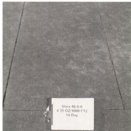
Urea 1/8 lb - Urea 46-0-0 1/8 lb 14 Day Interval