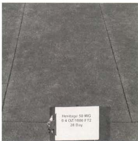
Heritage 0.4 oz 28 Day Interval