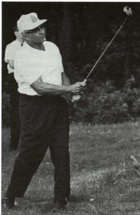
Golf played a special role for Vince Lombardi, Green Bay's coach of many moods.

Lombardi's mind, although never far from the football field, contained thoughts that July evening about his other favorite game, golf. Lombardi told the assembled audience in his raspy voice: "Those who like games get more out of golf than any other." He proceeded to draw analogies between the two sports he loved best. "Golf is more than a game. I liken it to football because it makes many of the same demands football does. For example, it takes courage—it takes a lot of guts to play golf. And it takes a lot of