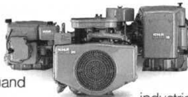
Kohler engines. Built for a hard day's work.

For power that can cut it, at any angle, Kohler verticals are equipped with full pressure lubrication and full-flow oil