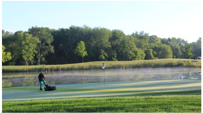
Above: Hole 15 called Landmark plays 180 yards