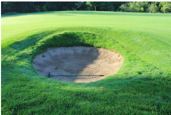
Top Left: Pot Bunker on the Par 5 13th Hole Top Right: Deep bunkers protect the green on hole 12. Bottom Right: Mowers on Hole 18 the 485 Yard Par 4 Bottom Left: The Bull has a number of boardwalk type bridges over the river and wetlands.