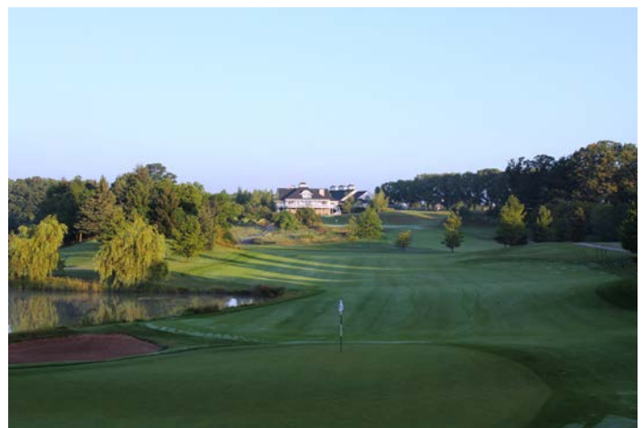
Bottom: Hole 9 called Dynasty plays 454 yards