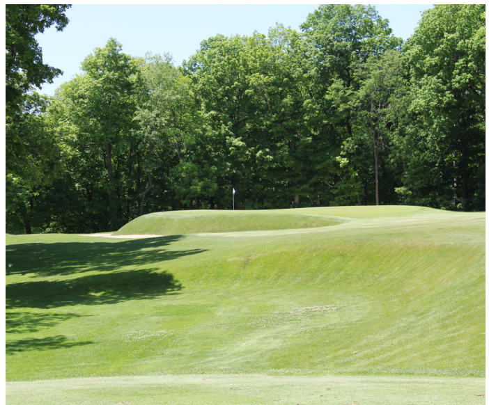
The Par 3 eighth hole shows some of the slopes and banks Langford’s design features.