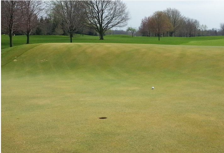
Above: The Par 5 Third Hole Has A Challenging Green