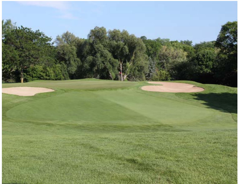
The par five 5th hole plays 548 yards uphill to a green well protected by bunkers.

Four days of championship play will provide for the true state champion and winner of the Sinnissippi Cup. The cup received its name from the first championship in 1901 when the amateur was played at Sinnissippi Country Club which is now the Janesville Country Club. While players compete for individual honors WSGA member clubs with three qualifiers compete for the Yule Cup awarded to the low club after the first 36 holes of play.