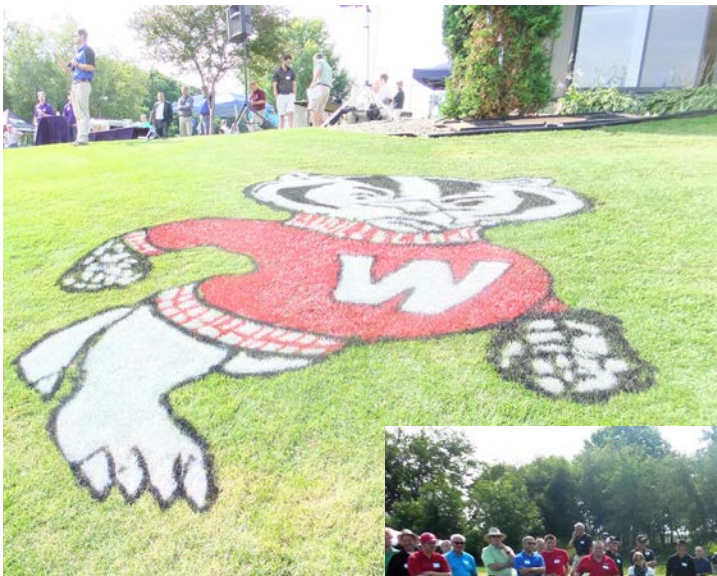
Left: Bucky is always present for WTA Field Day