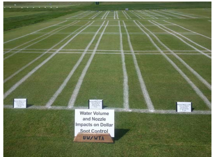
The Water Volume and Nozzle Impacts On Dollar Spot Plots Were Very Popular.