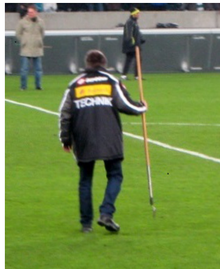
Divot repair tool for a soccer pitch, same as the one you carry except much larger.